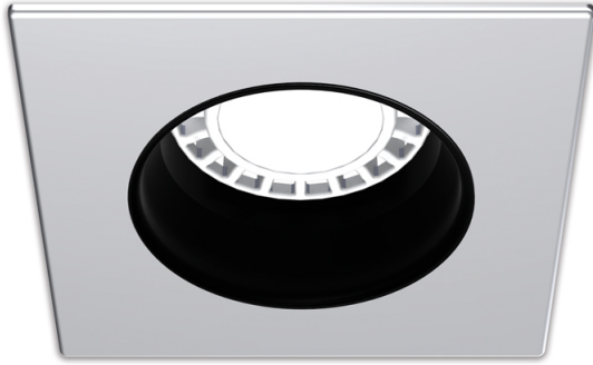
A2100-04 (illustrated) (Lamp not included)